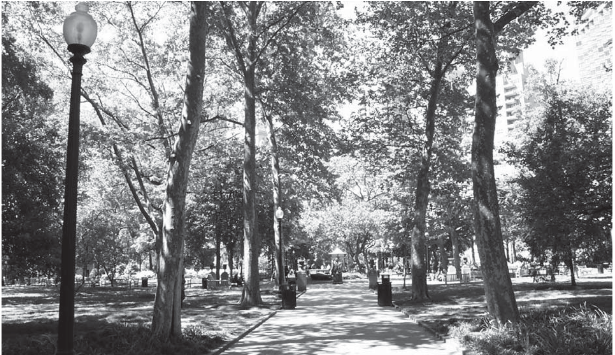
Parks can significantly increase nearby property values, as evidenced in the real estate that surrounds Rittenhouse Square.